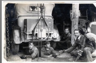
©Kretingosmuziejus / KretingaMuseum Lietuvos dailismuziejus / Lithuanian ArtMuseumkmlF 7184

Augmented reality apps allowing for historical images to be layered with actual experiences