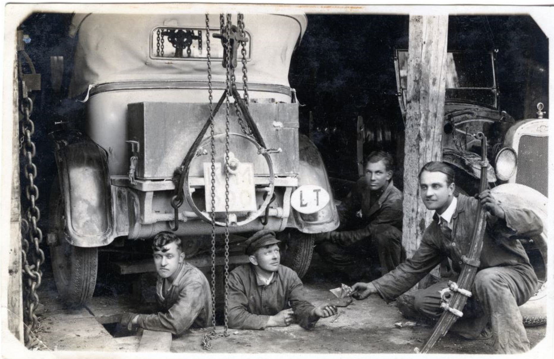
Kretingosmuziejus / KretingaMuseum Lietuvos dailsmuziejus / Lithuanian