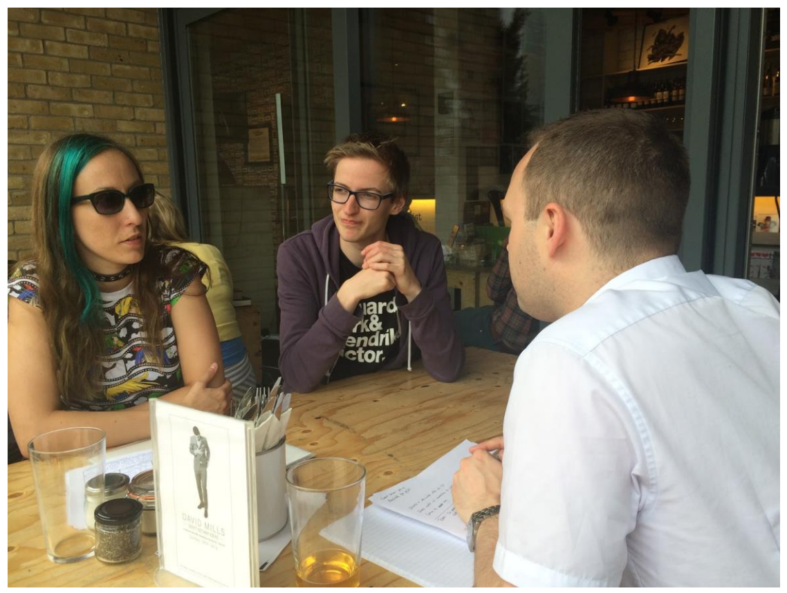
Business ideas being tested by Remix at the TV BMW

Teams from Art(f)inder, Bosch and Mnemosyne attended this workshop having been the three winners at the TV hackathon. The concepts of each team are described in D5.2 – Hackathons Report. After deliberation the following two were subsequently eliminated: