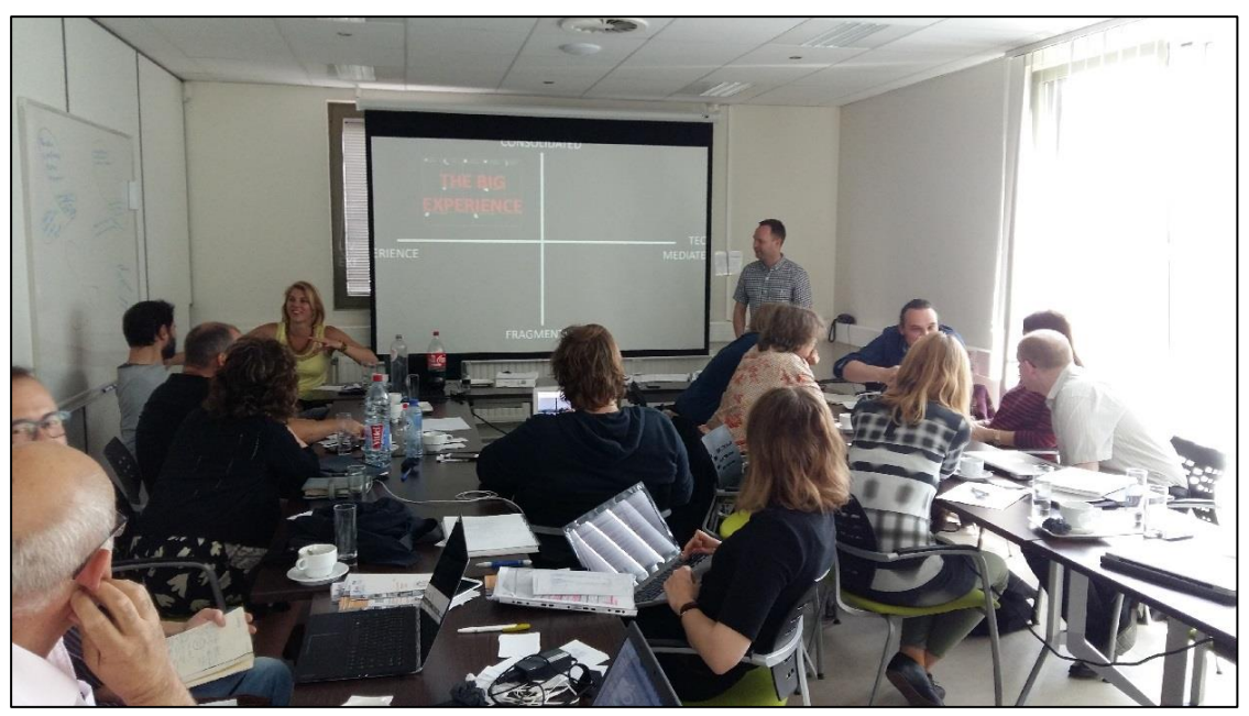
Project partners modelling their business ideas

The Business Modelling Workshops had a specific focus to serve the hackathon winners and not on project outcomes like the pilots and educational demonstrators. However, the DoW expressly states that the ideas explored in the pilots should be capitalised on through these BMWs. It was then decided that a BMW be held specifically for the pilots and demonstrators so that their products and ideas could get the same treatment that the hackathon winners received during their respective workshops. Thus a 7th BMW was added to the schedule, the day before the project General Assembly meeting, held in Brussels on 10 May 2016.