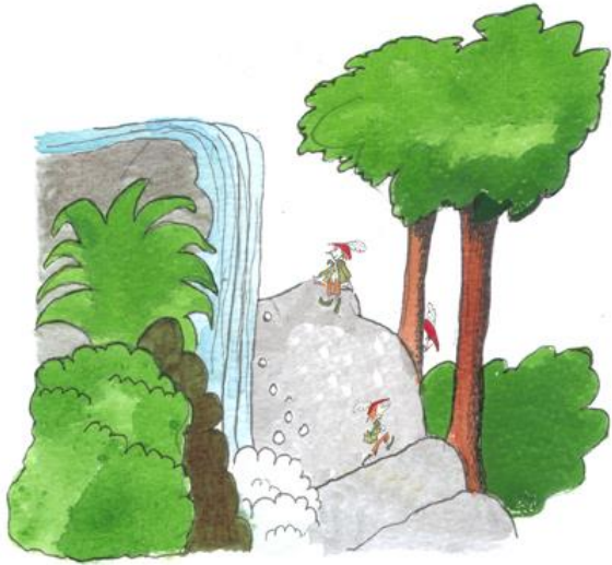
Illustration examples: The Fairies

Up the airy mountain, Down the rushy glen, We daren't go a-hunting For fear of little men; Wee folk, good folk, Trooping all together; Green jacket, red cap, And white owl's feather!