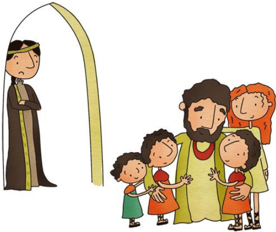
Illustration examples: The Children of Lir

Aoife grew jealous of the children of Lir because their Lir loved them more than he loved her.